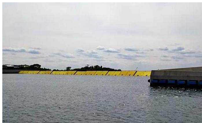
View of the MOSE system in operation

Number of recorded “Acqua alta” events per year since 1900.