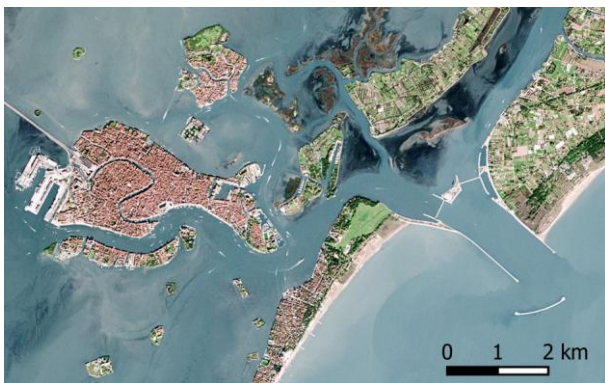
2022-11-24, Sentinel-2 (Detail)

Venice, the famous "Floating City" of Italy, has been built on hundreds of islands in a lagoon near the Adriatic Sea. Due to this exposed situation the town has long struggled with flooding both from the sea and from the mainland.