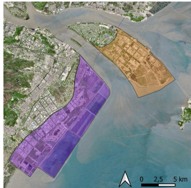
Sentinel-2, 2023-05-10 (overlay: land reclamation projects)