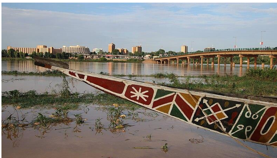
Niamey, Bridge crossing the Niger River